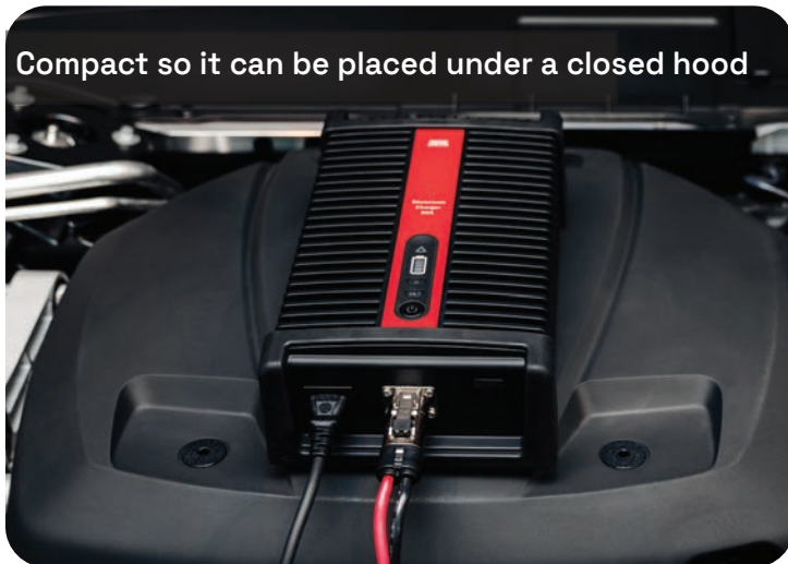
Compact so it can be placed under a closed hood