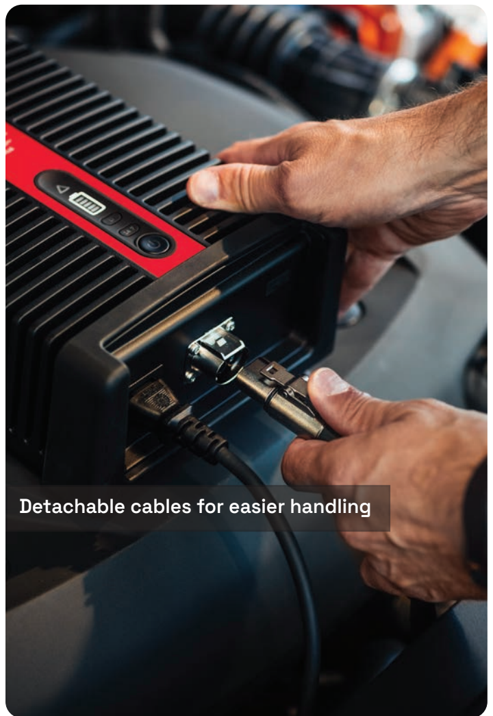
Detachable cables for easier handling

ShowroomCharger 40-50A 711300: With 5m/16.4' DC cable 713600: With 2.5m/8.2' DC cable